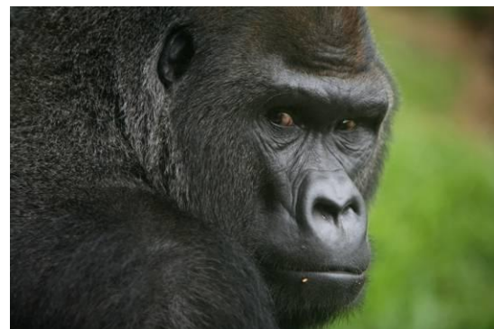
From top: Shoebill, African Finfoot & Mountain Gorilla