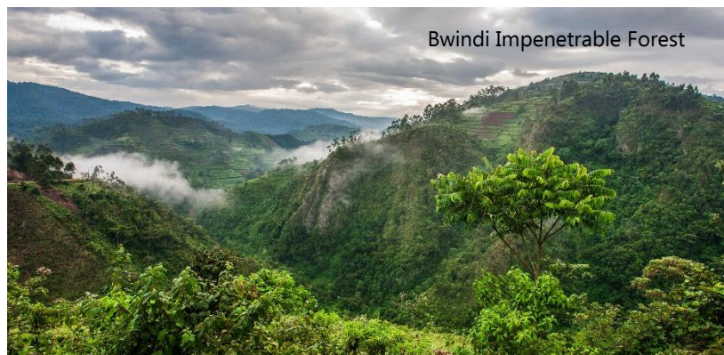
Bwindi Impenetrable Forest

Today we will spend the morning exploring the National Park Headquarters trails system. The main trail leading south offers good views of canopy and forest edge species which might include Equatorial Akalat, Olive Long-tailed Cuckoo, Dusky Tit, the scarce Oriole-Finch, White-tailed Ant Thrush, Black Bee-eater, African Sooty Flycatcher, Petit's Cuckoo-Shrike, Short-tailed Warbler, Western Bronze-naped Pigeon, Elliot's and Fine-banded Woodpeckers. The rare and elusive Red-fronted Antpecker can sometimes be seen probing and gleaning amongst the dead branches. We will follow our guide along the Waterfall Trail which winds through