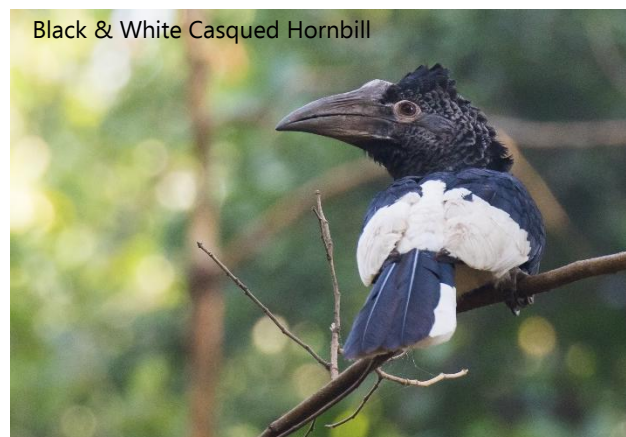
Black & White Casqued Hornbill

We now have 2 full days to explore the forests and other habitats around Budongo Forest and the Royal Mile. Our first morning is likely to be spent birding the famous Royal Mile area of Budongo forest which is considered by many to be the country's premier forest birding site. This stretch of dirt road connects the Nyabyeya Forestry College to the main research station and passes through relatively open Ironwood-dominated forest. Chocolate-backed, Blue-breasted and African Dwarf Kingfishers are remarkably common and this is definitely the best