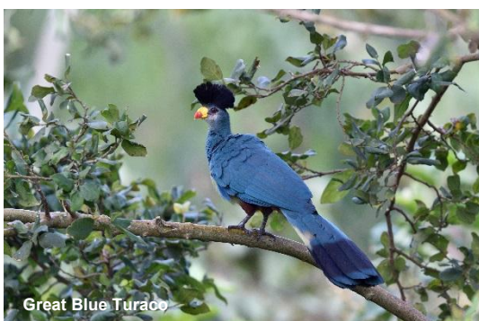
Great Blue Turaco

We will spend this morning further exploring Queen Elizabeth National Park before making the 2 - 3 hour drive to Kibale Forest National Park. This is another beautiful journey and we could be lucky enough to see a rare view of the snow-capped Rwenzori Mountains that usually remain shrouded in mist. We will stay in a comfortable lodge.