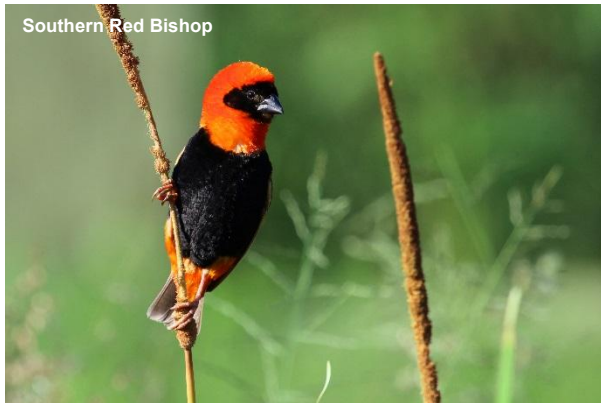
Southern Red Bishop

We will overnight in a comfortable lodge. After a delicious dinner we might be able to spot-light along the park's trails near the camp looking for African Scops Owl, Verreaux's Eagle-Owl, Fiery-necked or Black-shouldered Nightjars.